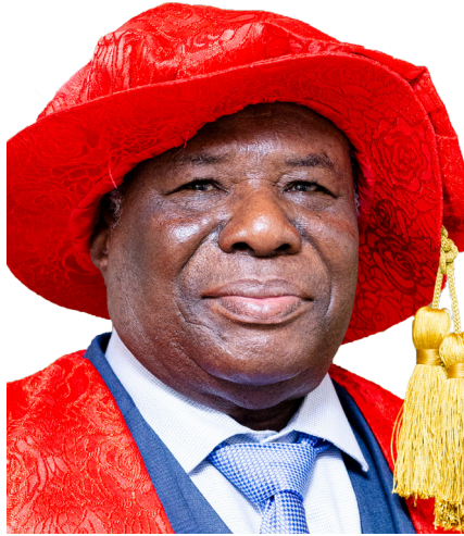
NEENYI GHARTEY VII OMANHENE OF EFFUTU TRADITIONAL AREA, WINNEBA